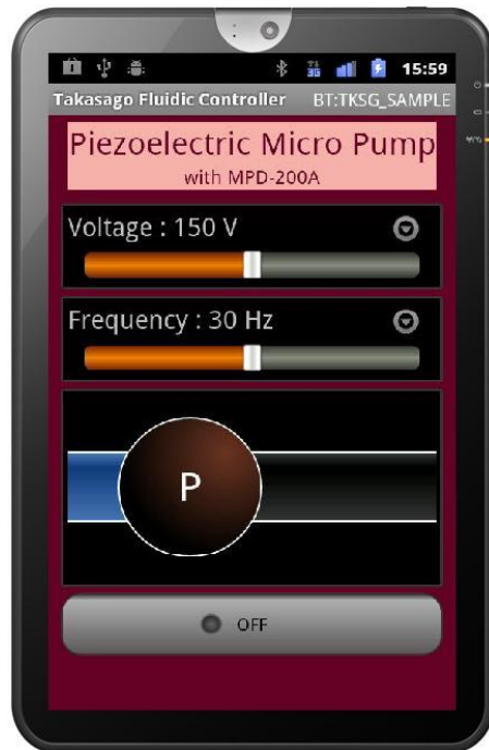
Operation Screen Image