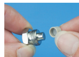
The cap frit can be easily replaced if it becomes contaminated/plugged.