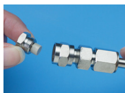
Reinstall the XF end fitting with cap frit.