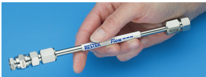
Assembled column with Trident integral guard system. To order, add "-700" to the catalog number of the column, and order guard cartridges and the XG-XF fitting separately.