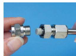
Add the XG-XF fitting.