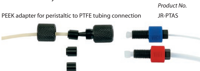
PEEK adapter for peristaltic to PTFE tubing connection Product No. JR-PTAS