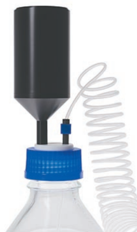
A typical use of SolviFlex Shown installed on a VICI cap and bottle, along with an exhaust filter