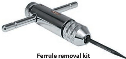
Ferrule removal kit For 1/16" and 1/8" ferrules