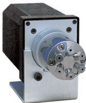
Model C6 1/16" ZDV fittings