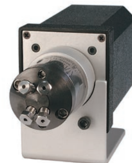
Model C74H (C74X similar) 1/16" ZDV fittings

CHROMalytic TECHNOlogy Pty Ltd AUSTRALIAN Distributors e-mail: sales@chromtech.net.au Tel: 03 9762 2034