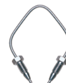
Order loops from page 159.