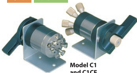
Model C1 and C1CF 1/16" ZDV fittings

5000 psi liq 50°C max PAEK stator Valcon E rotor