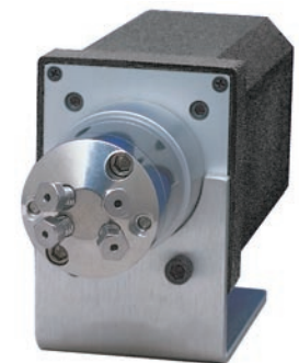
Model C4 1/16" ZDV fittings