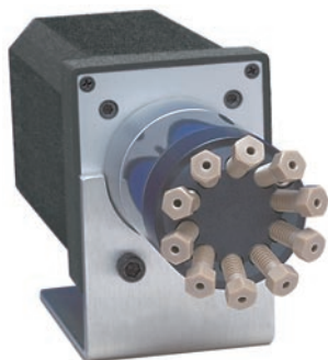
Model C2 1/16" ZDV fittings