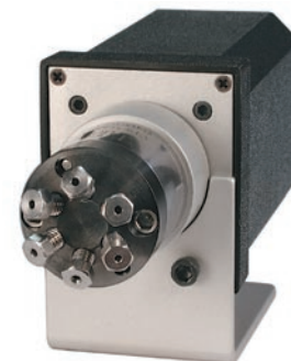
Model C72H (C72X similar) 1/16" ZDV fittings

CHROMalytic TECHNOlogy Pty Ltd AUSTRALIAN Distributors e-mail: sales@chromtech.net.au Tel: 03 9762 2034