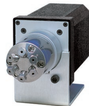
Model C2 1/16" ZDV fittings