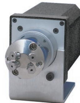
Model C4 1/16" ZDV fittings