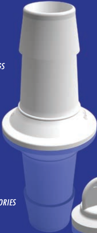
MINI FLANGE ACCESSORIES PG-18