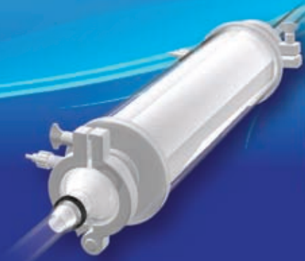
MINI FLANGE FITTINGS PG-16