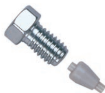
PEEK reducing ferrule and internal nut (Order nut separately.)