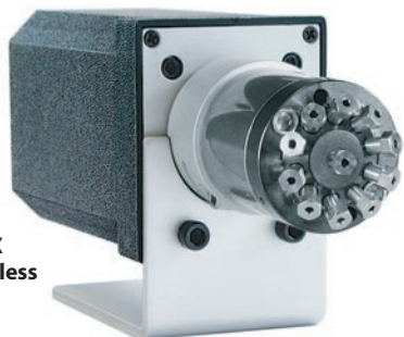
Model C75NX 1/32" Valco stainless fittings