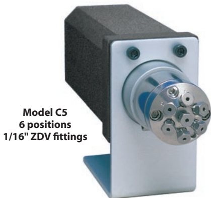
Model C5 6 positions 1/16" ZDV fittings