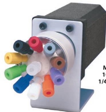
Model C25 10 position 1/4-28 fittings