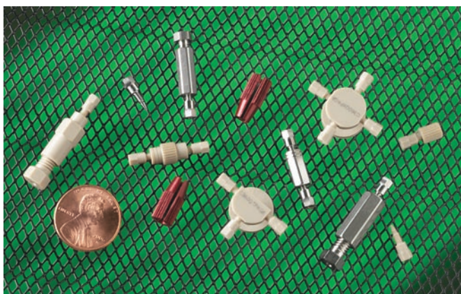
360 micron nanovolume fittings page 57-58

Our new high pressure fittings permit direct connection of 360 micron OD fused silica, PEEK, stainless, or electro-formed nickel tubing without the use of liners. The ferrule snaps into the nut so that the fitting is "one-piece", but the ferrule remains free to rotate as the nut is tightened so that the tube doesn't twist. Because of the compact size and fine 2-56 threads, a leak-free connection that seals at pressures in excess of 20,000 psi can be easily formed with the available manual tool.