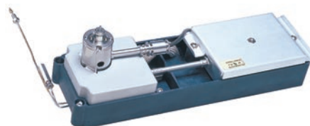
D-3-I-HP plug-in system for Agilent 6890 GC

All versions utilize the electronics and power supply of the host GC.